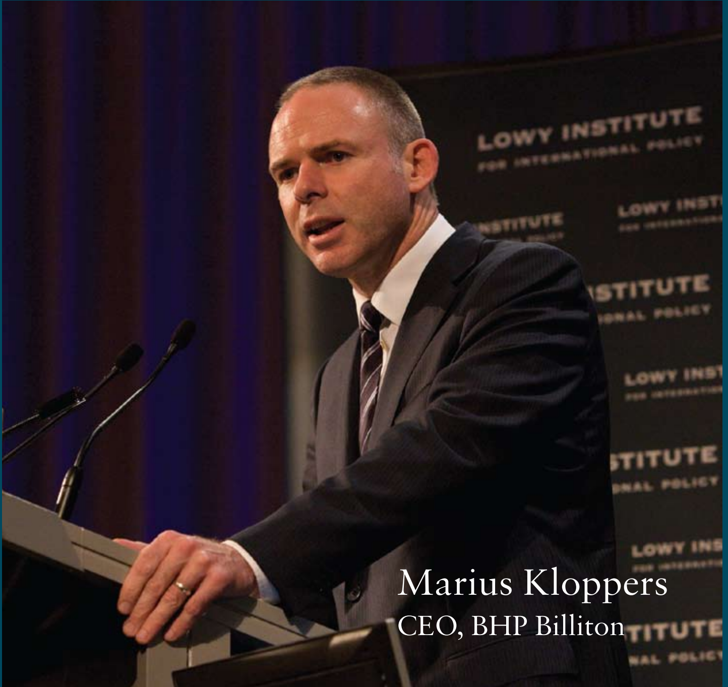
Marius Kloppers CEO, BHP Billiton